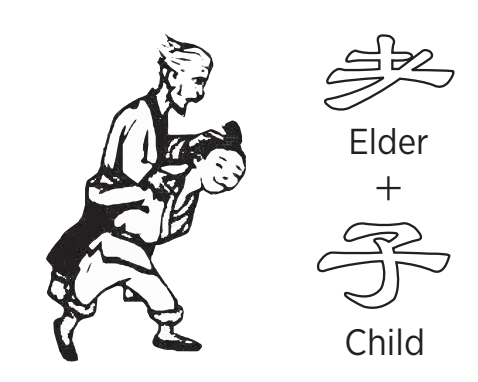
Like a child supporting an older person.